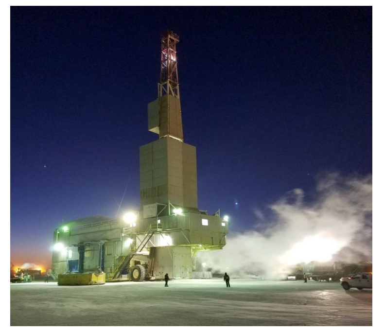
Figure 1 | Nordic Rig #3

Red Emperor announces that 88 Energy Limited (ASX/AIM: 88E), in its capacity as consortium operator, has advised that the mobilisation of Nordic Rig#3 commenced at 08:45 on 1 February 2019 (AK time) from Deadhorse, Alaska. The mono body rig structure will now travel approximately 90 miles to the Winx-1 well site. Additional equipment required for the commencement of drilling is being mobilised to site concurrently in order to meet the scheduled spud date of 15 February 2019.