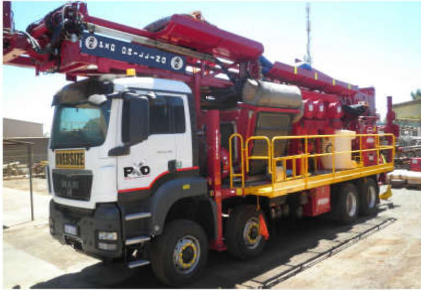
Picture 2. PDX Rig 3, Prior to Departing to the Great Western Gold Project.