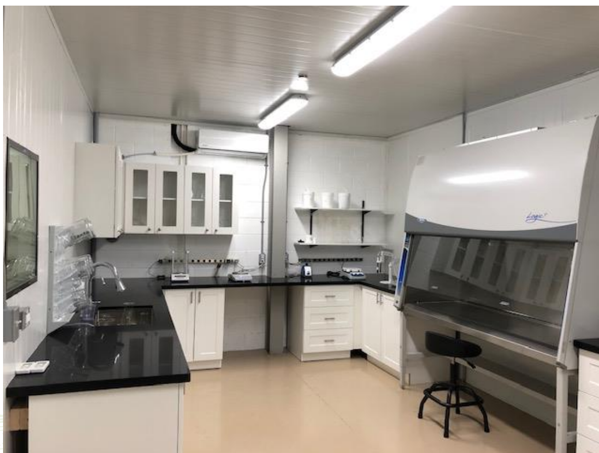
Figure 1: RotoGro Laboratory

Roto-Gro World Wide (Canada) Inc., a wholly-owned subsidiary of Roto-Gro International Limited (“ASX:RGI”, “RotoGro” or the “Company”), is pleased to announce the completion of its state-of-the-art laboratory located at the Company’s Research and Development Facility in Caledon, Ontario, Canada (“RotoGro Laboratory”).