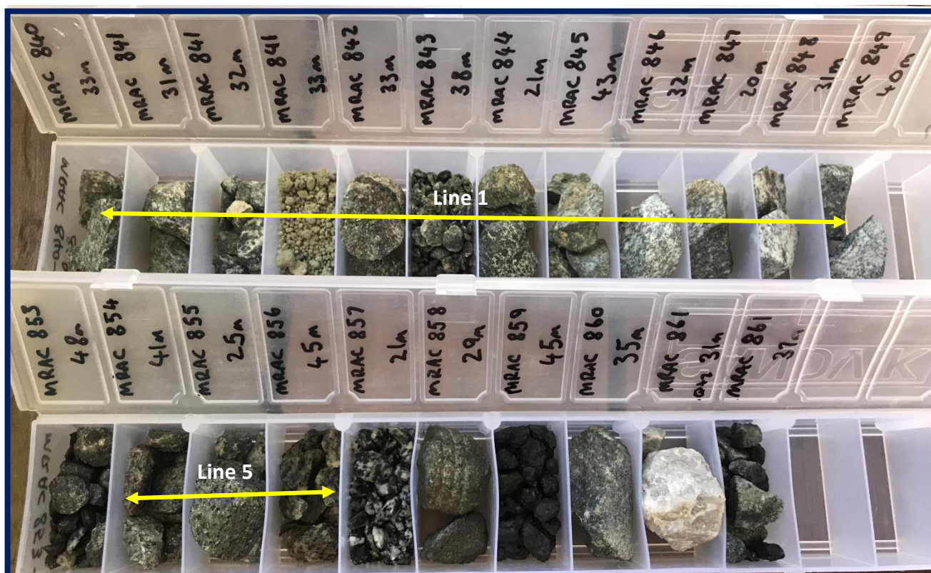
Figure 1. Chip trays from Lines 1 & 5 with coarse-grained varitextured gabbro-norite and olivine-bearing peridotite lithologies in end of hole samples.

Four discrete magnetic geophysical features have been tested by air core drilling comprising 28 holes and 937 meters at an average hole depth of 33.45m. The magnetic features were chosen as having similar geophysical signatures to the intrusive rocks that host the Nova-Bollinger mine. End of hole rock chips over three of the four targets tested identified coarse-grained varitextured gabbro-norite and olivine-bearing peridotite, similar to intrusive lithologies known to host magmatic nickel-copper sulphides already identified elsewhere on the Mt Ridley project.