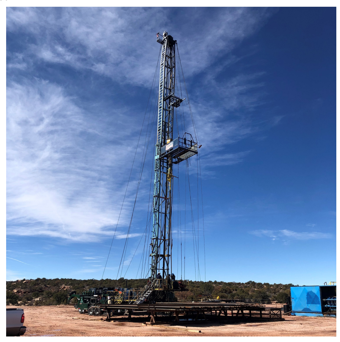
Figure 1: The workover rig set up on the Skyline drill pad.

Anson Resources Limited (Anson) has commenced drilling the re-entry of the Skyline Unit 1 well at its Paradox Brine Project. Figure 1 shows the "work-over" rig set up and drilling on the Skyline drill pad.