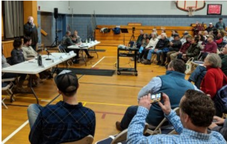
Figure 3. Community Forum in Cape Cod, Massachusetts, listening to a presentation on Clever Buoy.

The Company had the opportunity to present to public forum in Wellfleet that was attended by more than 125 local community members and elected officials. The forum and subsequent meetings with other regional groups, residents and local officials confirmed the urgent desire to have mitigation solutions in place for the upcoming northern hemisphere summer. So much is the urgency the community have formed a local action group and have commenced raising funds with the objective of funding a Clever Buoy deployment in Cape Cod this summer.