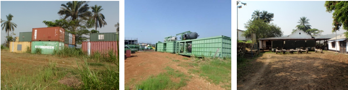
Figure 3, 4 and 5: Mechanical plant, equipment and storage and camp facilities at the Adidi-Kanga site

The review of the status of the Gold Project has confirmed that the Project is already permitted for development, with Environmental and Social Impact Assessments completed and financial guarantees in place with the appropriate regulatory and administrative bodies. This confirmation was an important step in the process to ensure that the Company could achieve the completion of a DFS in a short timeframe.