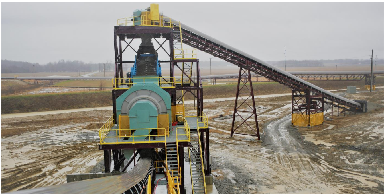
Figure 4: Raw coal reporting to the CHPP ROM screen and rotary breaker

The Company is targeting delivery of first processed coal to cornerstone customer LG&E in the second half of March 2019, and has progressed initial shipments activities, including a 2019 shipping schedule and invoicing and payment procedures.