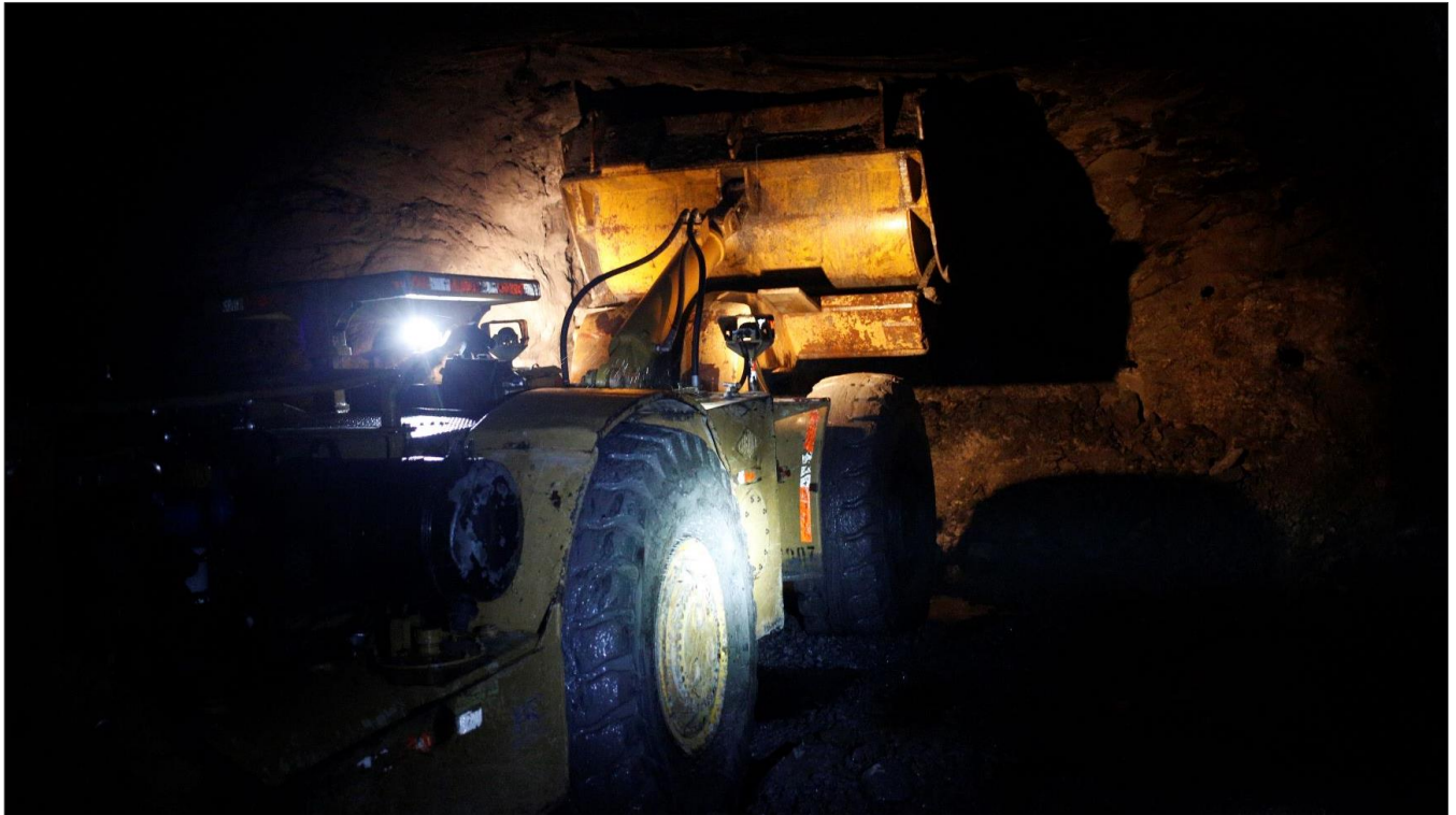
Figure 3: Paringa's mining contractor undertaking drill and blast activities at Poplar Grove