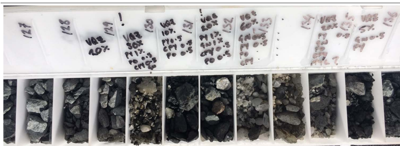
Figure 1. RC chip tray to the high-grade portion of the intersection, from 128m

*Intersection calculated from assays greater than 0.5g/t Au.