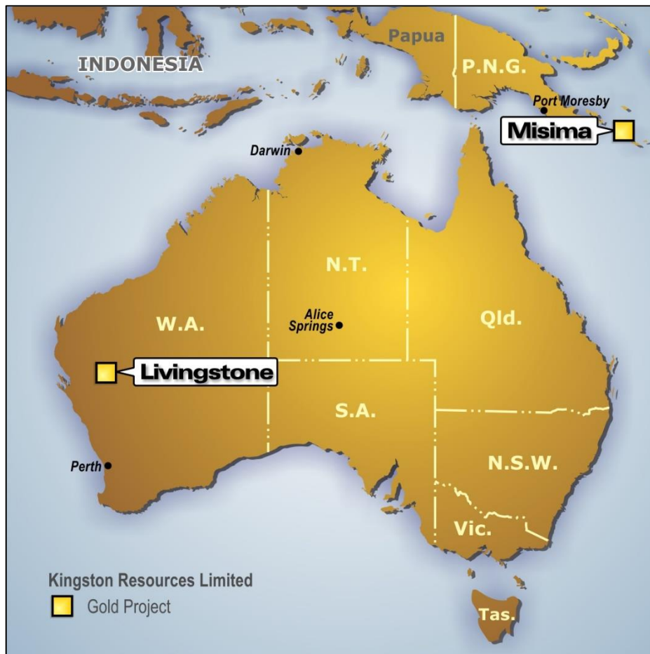
KSN project locations.

In addition, Kingston owns 75% of the Livingstone Gold Project in Western Australia.