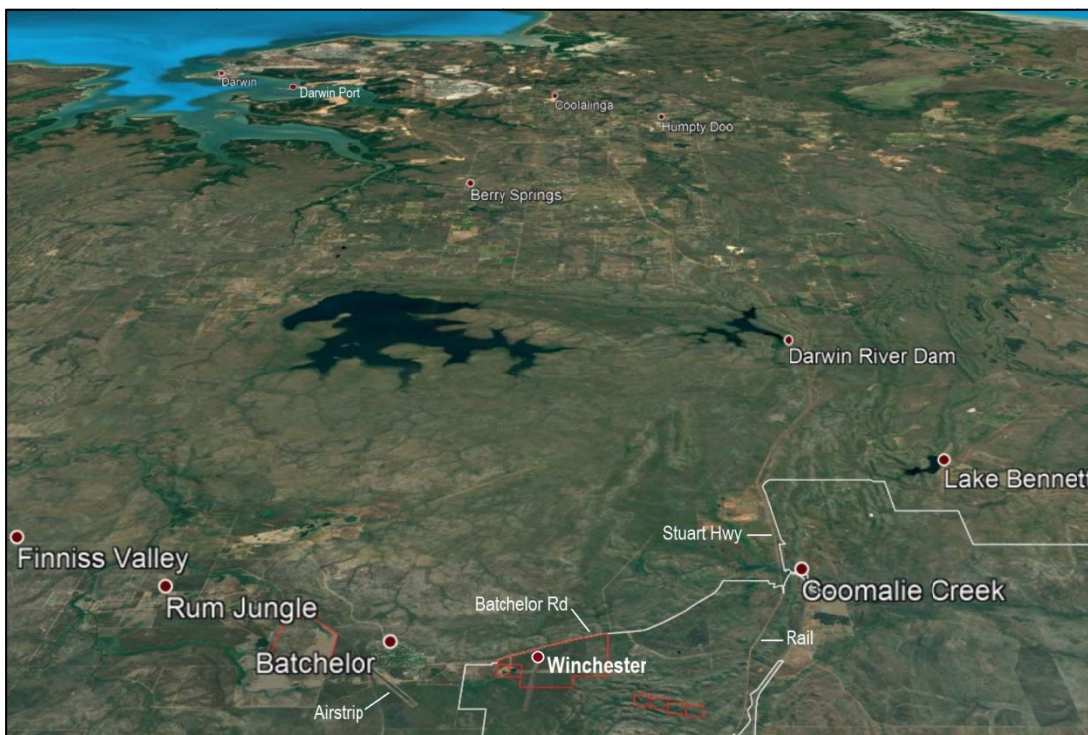
Figure 1 Location of Korab Group's mineral tenements (exploration leases in white and mining leases in red) and Winchester magnesium carbonate project relative to Darwin Port and basic infrastructure