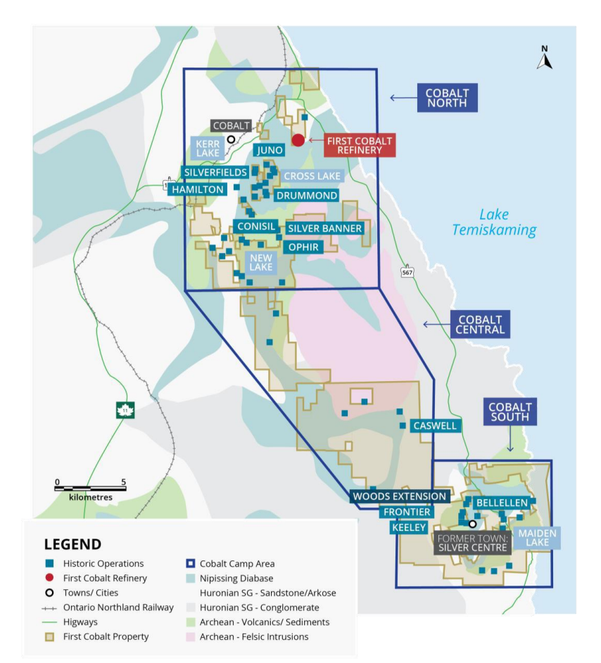
Figure 2. Regional bedrock geology of the Cobalt Camp showing target areas for exploration work in 2018.

First Cobalt controls almost half of the historic Canadian Cobalt Camp, with more than 50 past producing mines over 100km<sup>2</sup>. The focus for exploration is to identify near-surface cobalt-silver mineralization amenable to open pit mining.