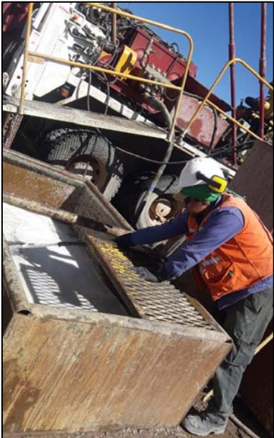
Figure 2: Brine sampling, drillhole C-03-19, Candelas project, Hombre Muerto