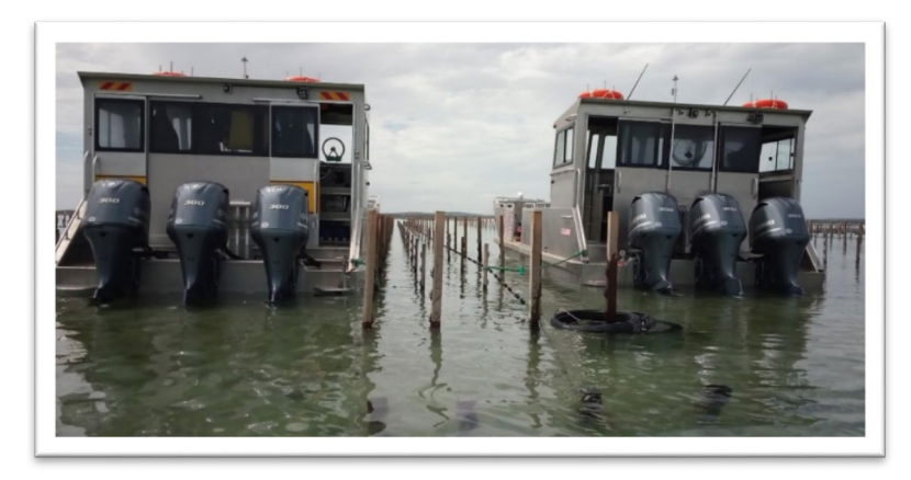
Figure 4: Completed Cowell processing facility and 6X6m cool room