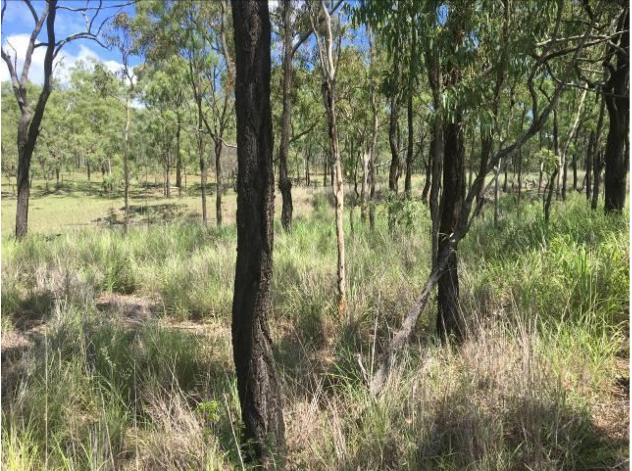
Figure 4: Princhester Project environmental setting