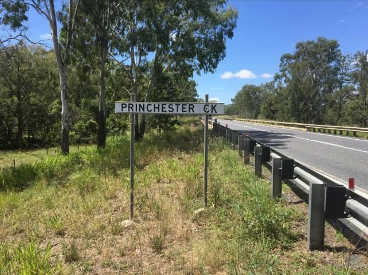
Figure 3: Princhester Project access via Bruce Highway