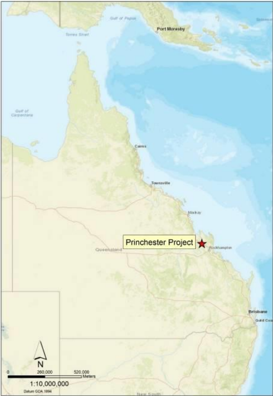
Figure 1: Location of Princhester Project, Queensland