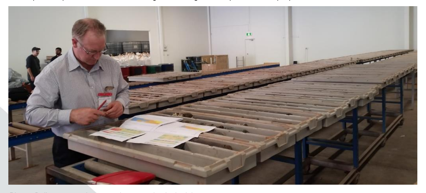
Plate 3 Bulk core sample test work preparation in the laboratory

The logging and interpretation of empirical data has allowed the AVL geological and metallurgical teams to develop a comprehensive understanding of the magnetic response of the proposed ore.