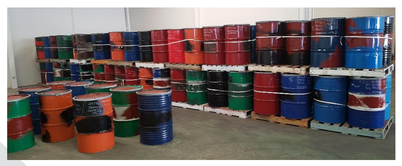
Plate 6 Material collected in drums