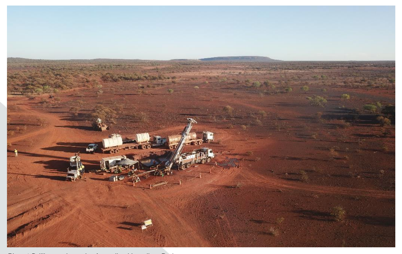
Plate 1 Drilling onsite at the Australian Vanadium Project

The drill program was completed in late March 2019, ahead of schedule.