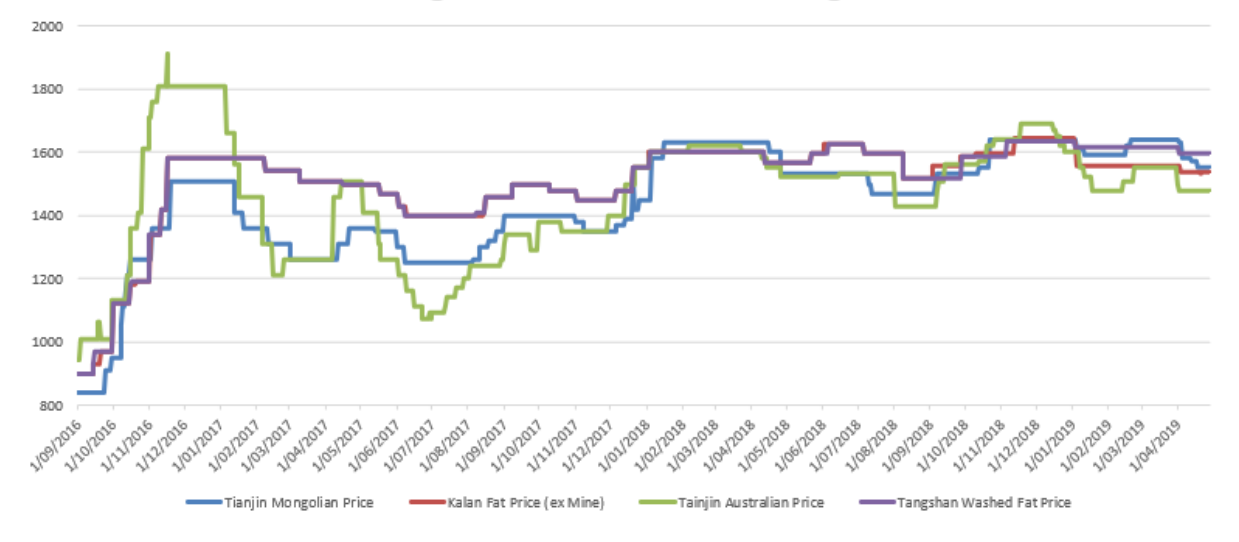
Figure 3: Coking Coal Prices in Tianjin China