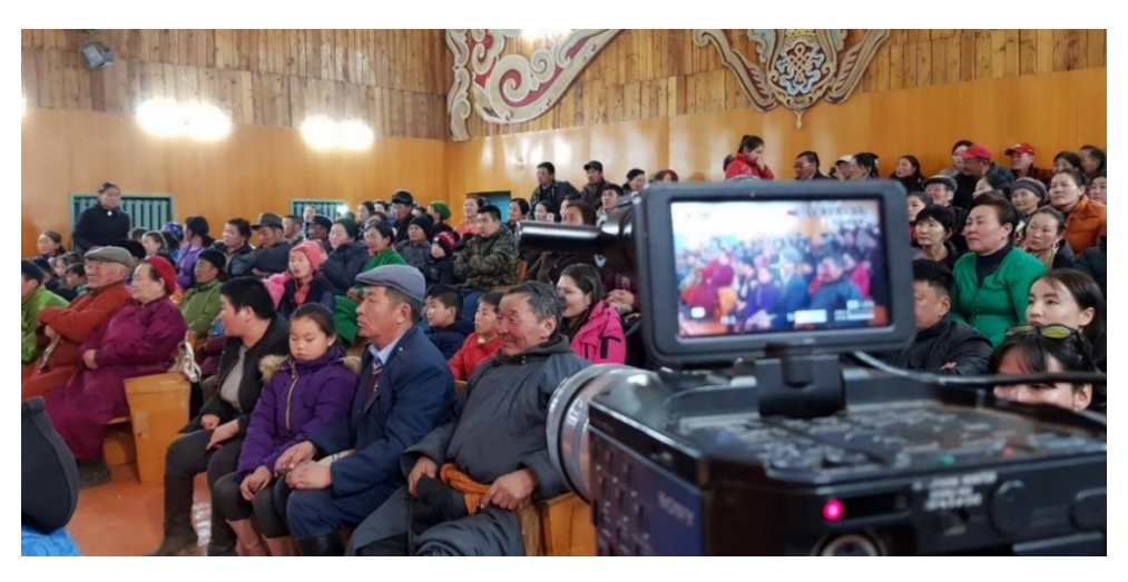
Figure 2: Open day event in Tsetserleg Soum

Open day events were held with 450 attendees at Tsetserleg (10% of the population) and 400 attendees at Murun. In addition, the CR teams made nearly 1,000 visits to households through the Tsetserleg soum area to provide direct information on the Company's activities and strategies.