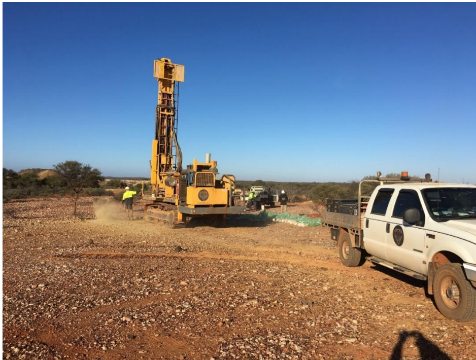
Track-mounted multipurpose rig drilling at Abbots Gold Project

Ora Gold Limited (ASX: OAU) ( Company ) is pleased to announce the completion of the first round of reverse circulation (RC) drilling at the Abbots Gold Project (M51/390). The program was designed to extend and duplicate some of the gold intersections from previous explorers and to validate the mineralisation model in the upper part of the mineralised system. Additional drilling and other pre-development activities are to commence soon in preparation for potential open pit mining along the 1.7km strike length of gold mineralised lineament at the Abbots Gold Project.