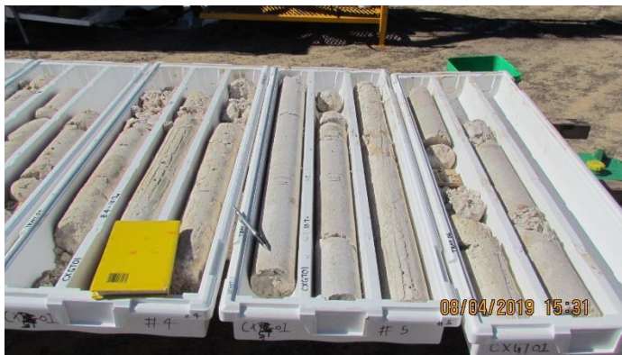
Diamond drill core from Cadoux kaolin project April 2019