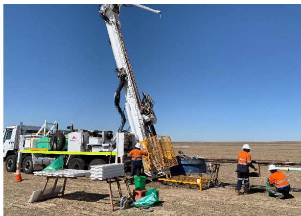
Diamond drilling at Cadoux kaolin project April 2019

The results of the analysis reflects the demonstrated high quality of the Cadoux kaolin and its potential for feedstock for HPA.