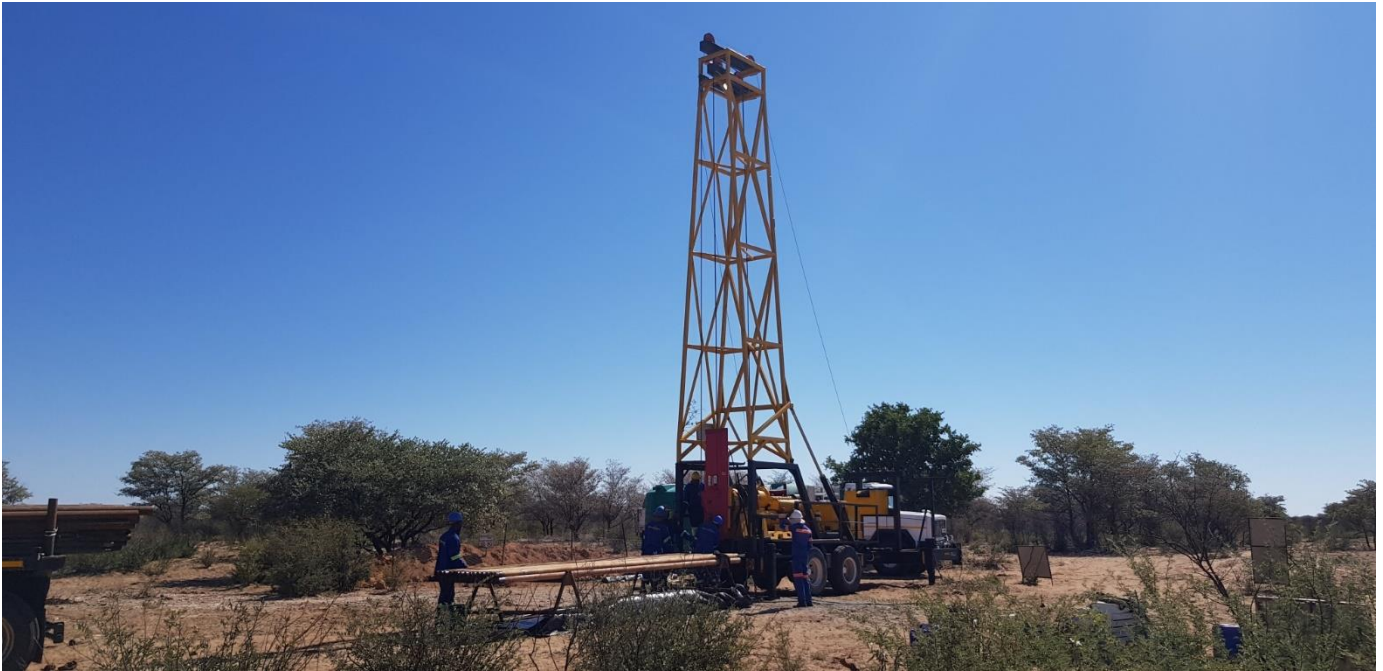
Figure 2 – Diamond drill rig at Korong Domal Prospect on 29 May 2019