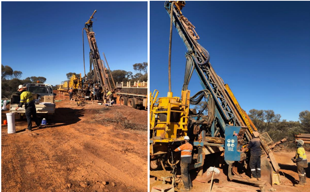
Figure 1: Challenge Drilling commences RC program at Shepherds Bush Mt Ida Gold Project

Alt Resources Ltd ( ASX: ARS , Alt or 'the Company') is pleased to report that Challenge Drilling commenced the RC drilling program at the Shepherds Bush Prospect on the 1 st June 2019 (Figure 1 below). Historical drilling results at Shepherds Bush, announced in February 2019 1 , indicate broad zones of gold mineralisation with minimal drilling by historical explorers.