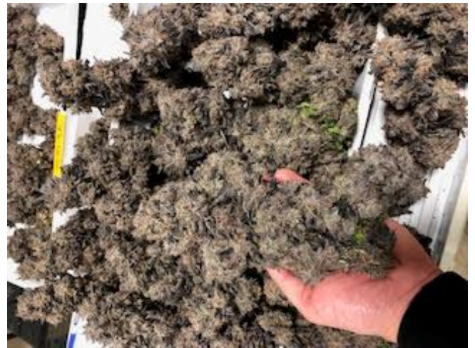
Figure 2: Harvested Cannabis Product from Growing Trials