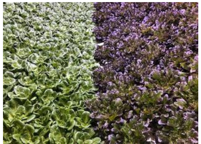
Figure 4: Leafy Green Trials