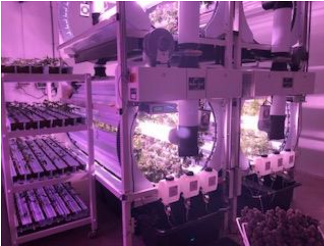
Figure 1: New Trays ready for Loading into Rotational Gardens