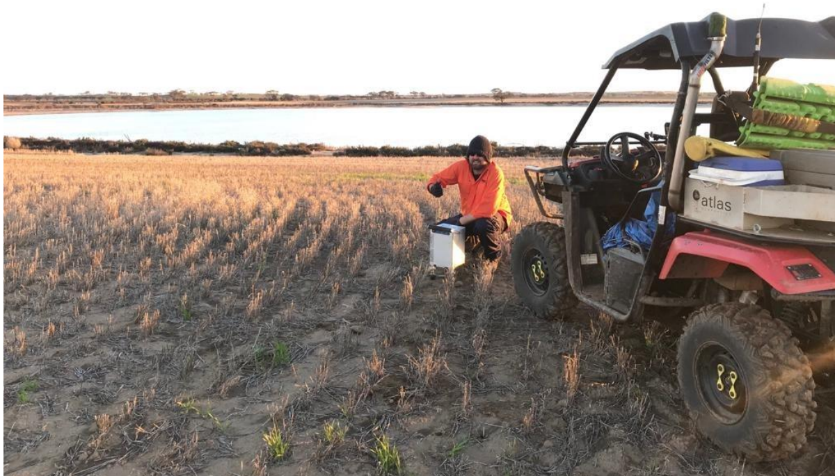
Figure 2: Gravity surveying underway at Cygnus Gold's Lake Grace project.