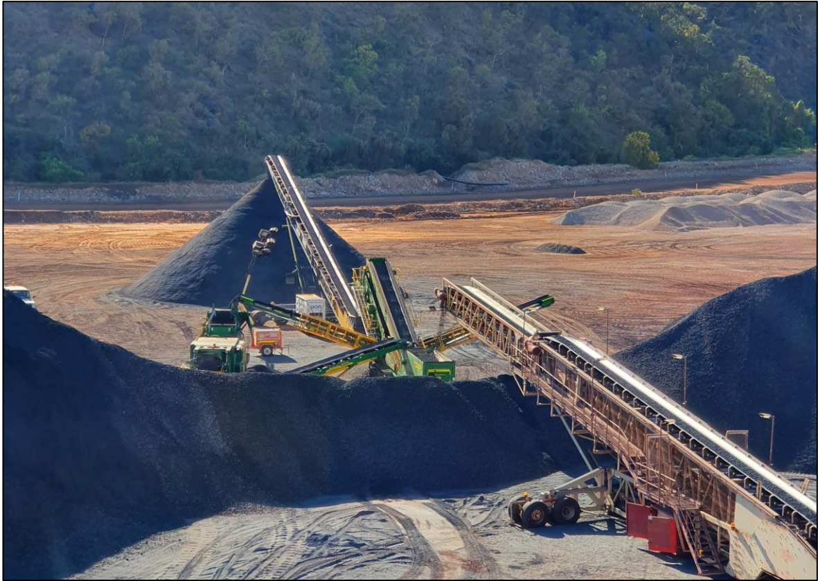
Figure 3: Crushed stockpile yard, early July 2019.