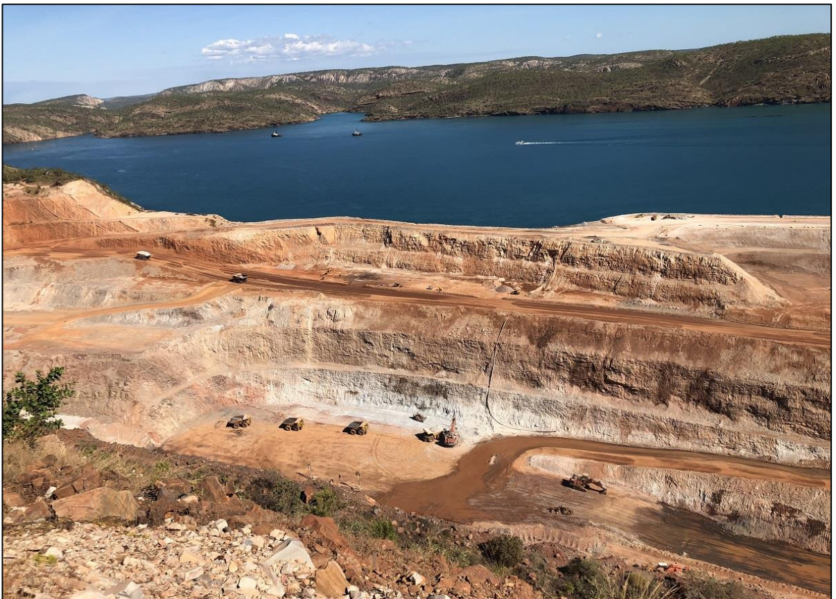
Figure 2: Waste stripping at east end of Main Pit, mid June 2019.