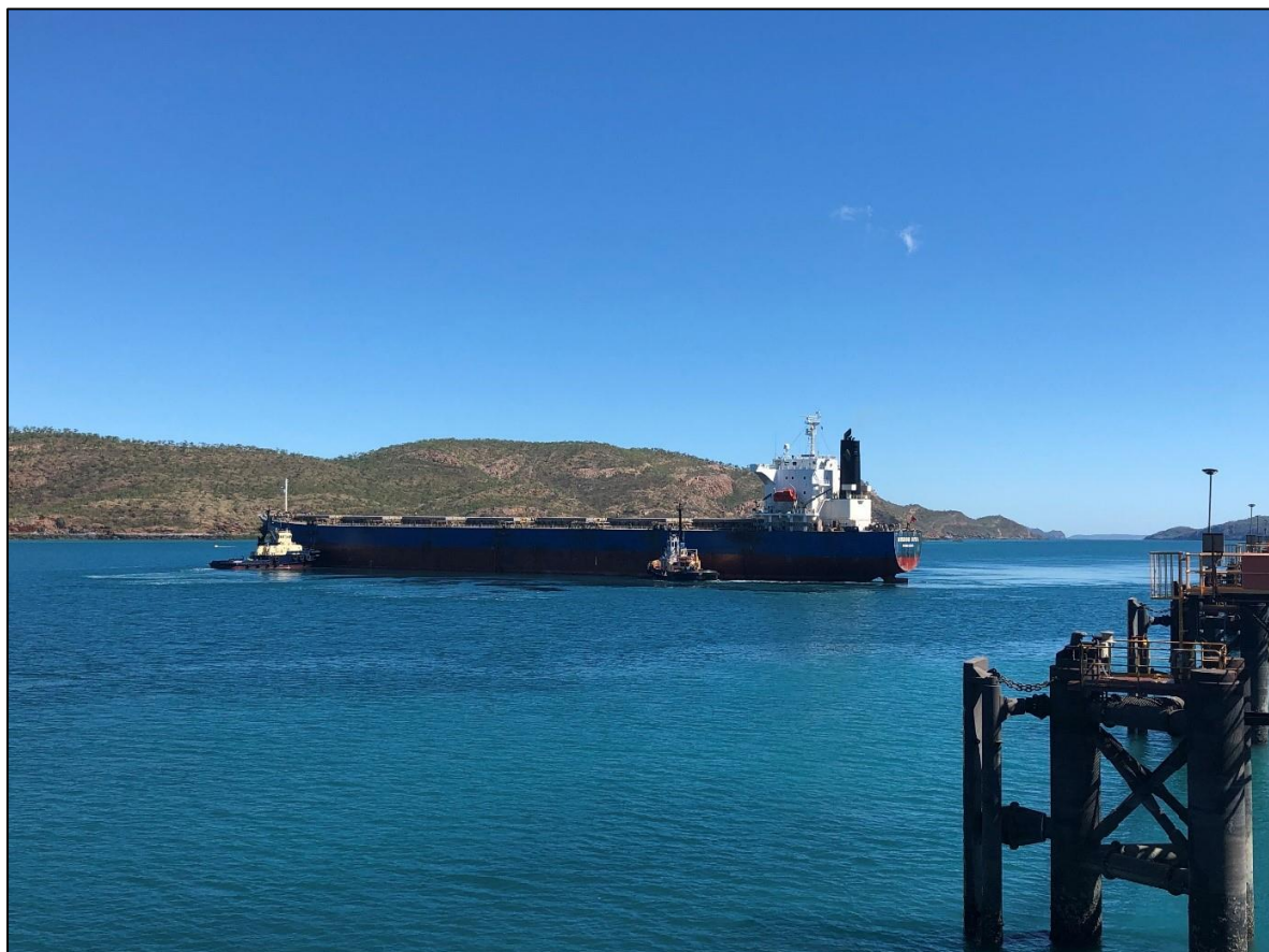
Figure 4: Bulk ore Panamax carrier Wisdom Diva berthing at Koolan Island, late May 2019.