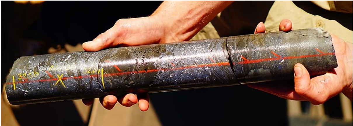
Figure 1: Semi Massive Galena (Grey, Metallic) Replacement. ACD080, 32.8m. Part of an interval 25.7m to 37.9m (12.2m length) of well mineralised core – consisting of strong galena, some pyrite and minor sphalerite

Most of the core, and all the RC samples have now been logged. Visual assessment of lead mineralisation indicates that significant intersections have been obtained. As well as expected galena (lead sulphide) (Figures 1, 2 and 3) in mineralised intersections, significant amounts of sphalerite (zinc sulphide) were observed in the drill core (Figures 4 and 5).