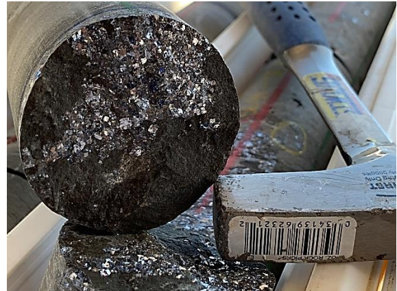
Figure 3: Crystalline Dark Grey Galena in AB034 56.4m (Freshly Broken Core). Part of an interval 52.1m to 59.6m interval with strong galena hosted by slump breccia and Knox Sediments