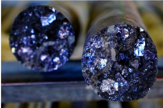
Figure 2: Crystalline Galena in ACD080 32.8m (Freshly Broken Core). Part of an Interval 25.7m to 37.9m of Well Mineralised Core – Consisting of Strong Galena, Some Pyrite and Minor Sphalerite.