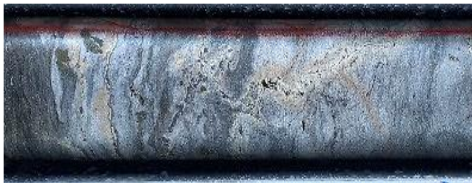
Figure 5: Abundant Cream Coloured Sphalerite in ACD63, 76.7m. Part of an interval 75.3m to 79.1m with common sphalerite as veins and matrix fill in slump breccia