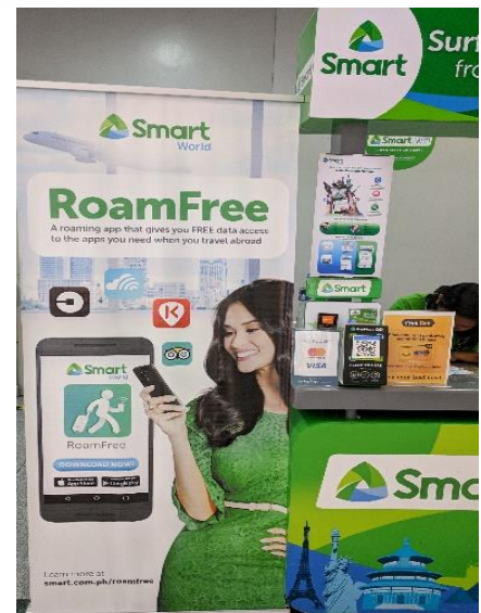
RoamFree promotion in Ninoy Aquino International Airport, Manila, Philippines

Given the strategic success of the RGP within Smart, Syntonic is now in discussions to integrate additional RGP services in the Smart network that includes use of the Syntonic captive portal and mCommerce services using the Syntonic direct-carrier-billing platform.