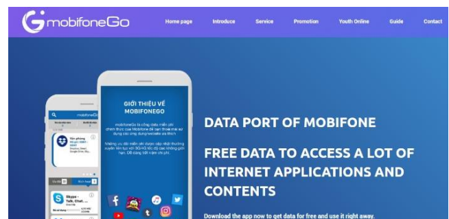
Caption from MobileFone's website (translated), promoting the mobifoneGo service

mobifoneGO is a white-labelled version of the Syntonic RGP licensed to Mobifone Telecommunications Corporation (“MobiFone”). MobiFone received a government certificate to accept consumer payments via MobifoneGO on 18 April 2019. The service, the first deployment of Syntonic’s mobile commerce solution outside of Brazil, provides subscription-based content plans with unlimited mobile data, e.g. the Chat plan includes unlimited access to Whatsapp, SKYPE, VIBER, and Zalo for a fixed fee.