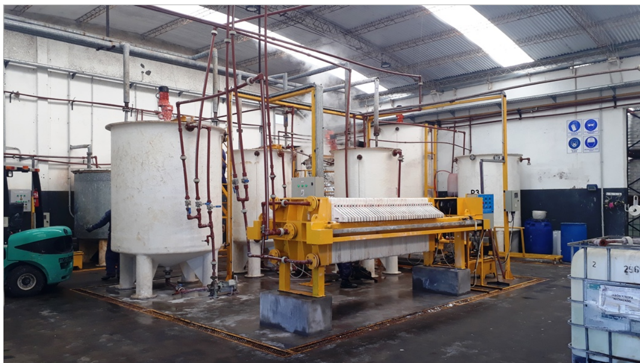
Figure 1. Rincon Lithium Project – Pilot Plant Lithium Carbonate Production Operations

A brief summary of works conducted during the Quarter is noted below.