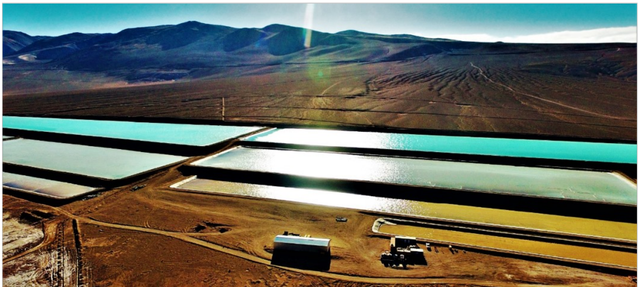
Figures 3 - 4. Rincon Lithium Project – Current Operational 38Ha Evaporation Ponds