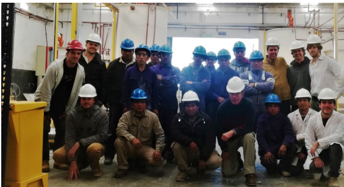
Figure 2. Rincon Lithium Project – Industrial Scale Pilot Plant Operations Staff

The industrial scale pilot plant was first commissioned in April 2018, with first battery grade 99.5% lithium carbonate confirmed in August 2018, and commencement of continuous production operations in July 2019.