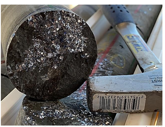
Figure 3: Crystalline Dark Grey Galena in AB034 56.4m (Freshly Broken Core). Part of an Interval 52.1m to 59.6m With Strong Galena Hosted by Slump Breccia and Knox Sediments.