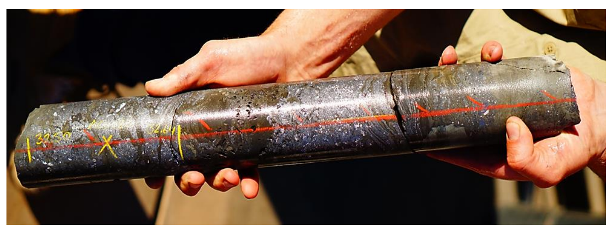
Figure 1: Semi Massive Galena (Grey, Metallic) Replacement. ACD080, 32.8m. Part of an Interval 25.7m to 37.9m (12.2m Length) of Well Mineralised Core – Consisting of Strong Galena, Some Pyrite and Minor Sphalerite.