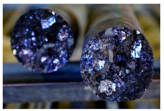
Figure 2: Crystalline Galena in ACD080 32.8m (Freshly Broken Core). Part of an Interval 25.7m to 37.9m of Well Mineralised Core – Consisting of Strong Galena, Some Pyrite and Minor Sphalerite.