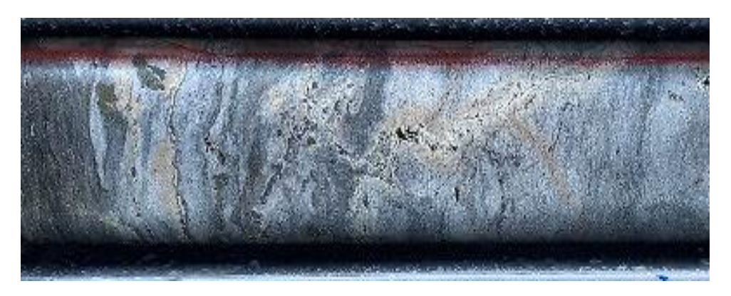
Figure 5: Abundant Cream Coloured Sphalerite in ACD63, 76.7m. Part of an Interval 75.3m to 79.1m With Common Sphalerite as Veins and Matrix Fill in Slump Breccia.