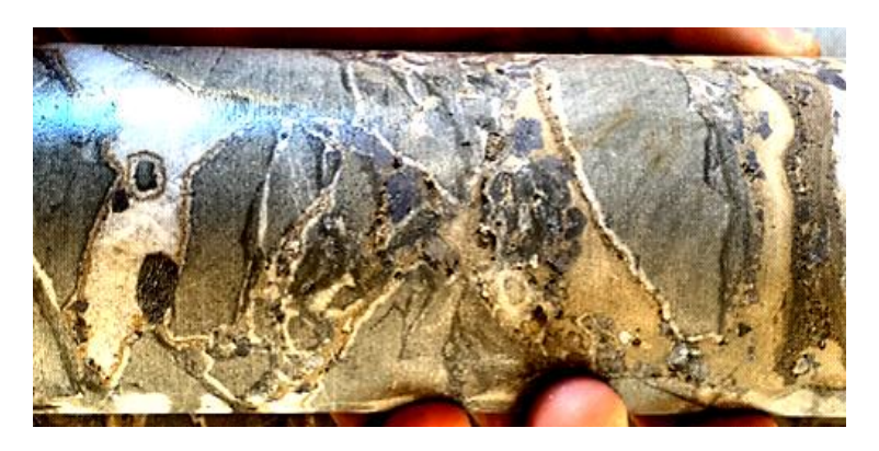
Figure 4: Abundant Pale Brown Sphalerite and Coarse Galena Crystals (Grey) in Matrix of Sedimentary Breccia in ACD81, 61.5m. Part of an Interval 60.5m to 64.5m of Well Mineralised Core Consisting of Strong Galena and Pyrite, and Common Sphalerite.

The Company's technical team sees great potential for the delineation of further zinc resources to add significant value and enhance Project economics. The relatively low zinc content of the Sorby Hills lead ore could also be extractable if a zinc circuit can be justified by increasing the zinc dominant resource at Alpha Zinc Deposit.