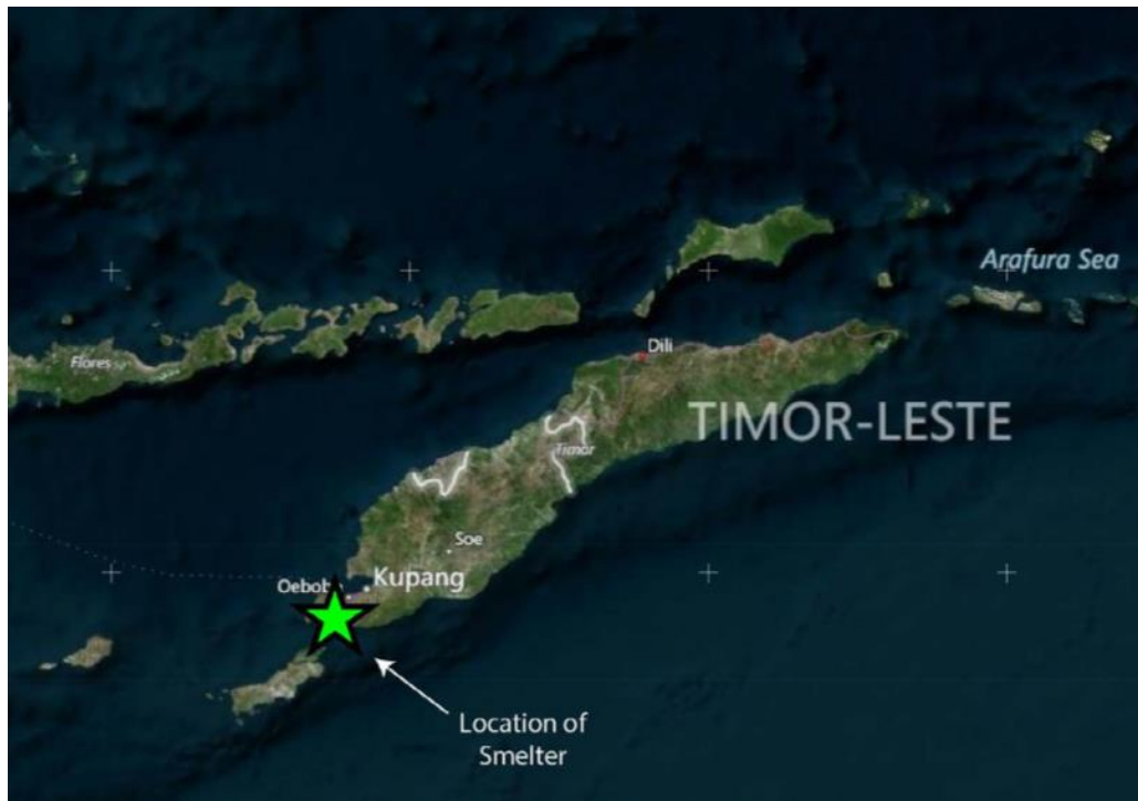
Figure 1: Location of Gulf's Kupang Smelting Hub Facility in relation to Timor-Leste