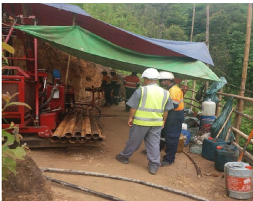
Figure 1. Man-portable rig drilling on Yegon Ridge.