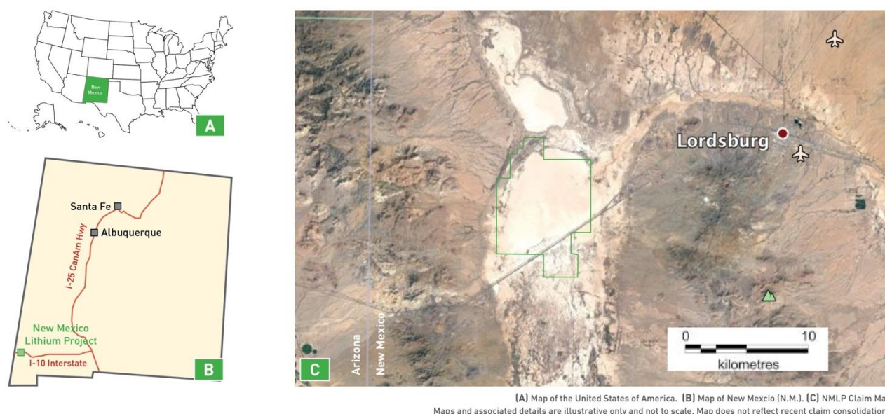
Fig. 2: New Mexico Lithium Project (NMLP, central playa)