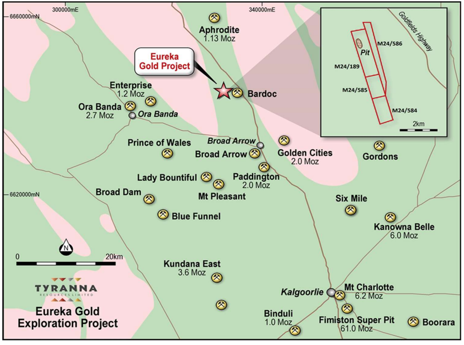
Figure 1: Eureka Project Location

Negotiations with nearby mills have been on-going with the aim to achieve the best outcome for the EGP. The EGP is located on a granted mining lease and is 50km north of the gold mining centre of Kalgoorlie, Western Australia. Since taking control of the EGP on 21 September 2018, Tyranna has completed two drilling programs and a Restart Study (refer ASX announcement on 24 May 2018) to progress Eureka to production.