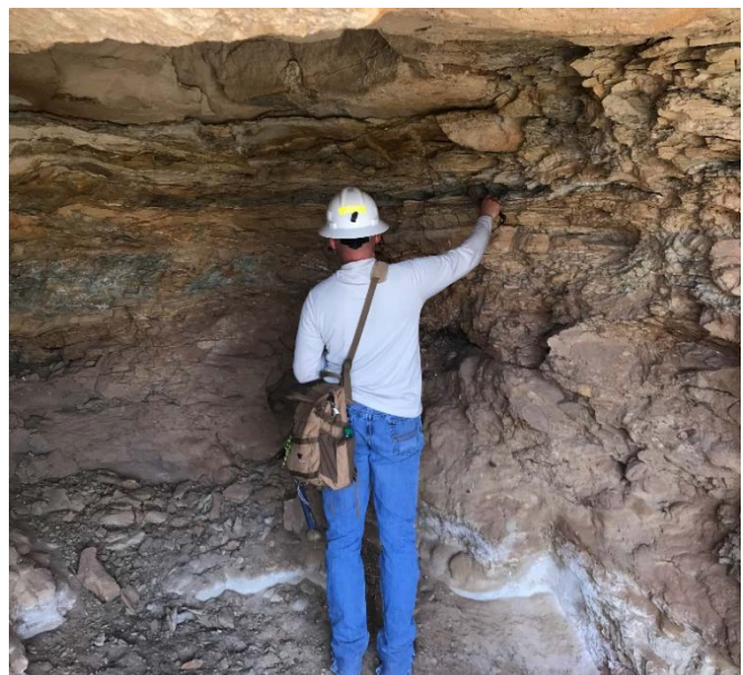
Figure 1 Visible mineralisation from recent site visit in July 2019, the image on the left shows mineralisation in the pillar of underground workings at Rat Nest and the image on the right shows the SRK geologist testing mineralisation in a short adit at Jeffrey

Through the acquisition of Voyager, the Company will acquire eight strategically located projects: Jake, Jeffrey, Moki, Point, Pinto, Woodruff, Rat Nest and Bruce which form an improved consolidated portfolio of highly prospective assets containing known uranium and vanadium mineralisation (together the Properties ). The Susannas group of claims (being 32 claims) will no longer form part of the Properties and have been replaced.