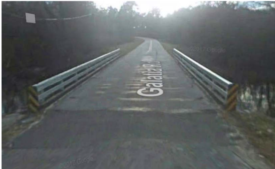
Figure 2. Bridge used for NCDOT trial

As previously announced ( ASX:EDE -31 July 2018 - Quarterly Report to 30 June 2018 ) EdenCrete® is also presently being tested in an ongoing bridge trial in North Carolina by NCDOT which started in July 2018 (see Figure 2 ).