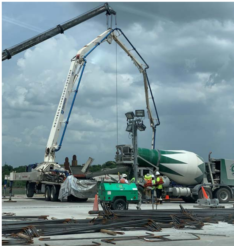
Figure 3. Repairs being undertaken on the Port of Savannah wharf