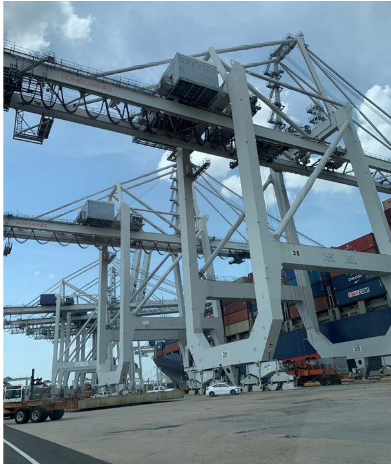
Figure2. Container cranes at Port of Savannah