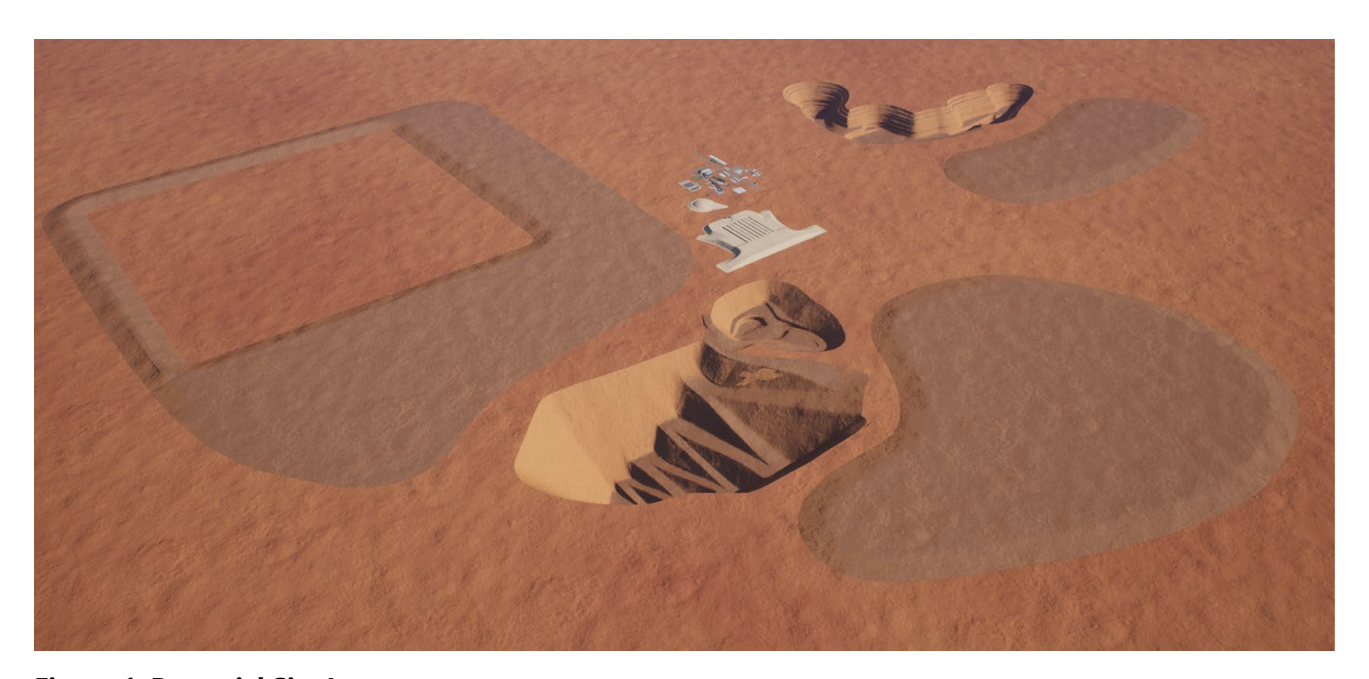
Figure 1: Potential Site Layout