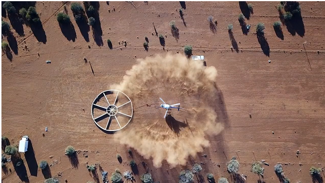
Figure 1: NRG Heli EM survey underway at Bottle Creek and Shepherds Bush projects

The Company recently completed a Helicopter-borne Time-Domain Electromagnetic (HTDEM) survey at the Bottle Creek and Shepherds Bush project areas using the New Resolution Geophysics (NRG) Xcite system (Figure 1). NRG surveyed 284 line kilometres across the two project areas and the data is now being reviewed with interim data indicating the presence of stratigraphic conductors and some positive structural corridors for future exploration drilling.