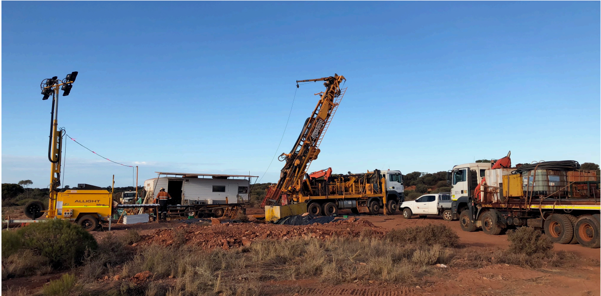
Figure 3: DDH1 Drilling at Emu deposit Bottle Creek 2018

Time permitting the Company will drill additional RC holes at the Cascade and Boags South areas plus further follow up drilling at the recently drilled Pianto's Find prospect