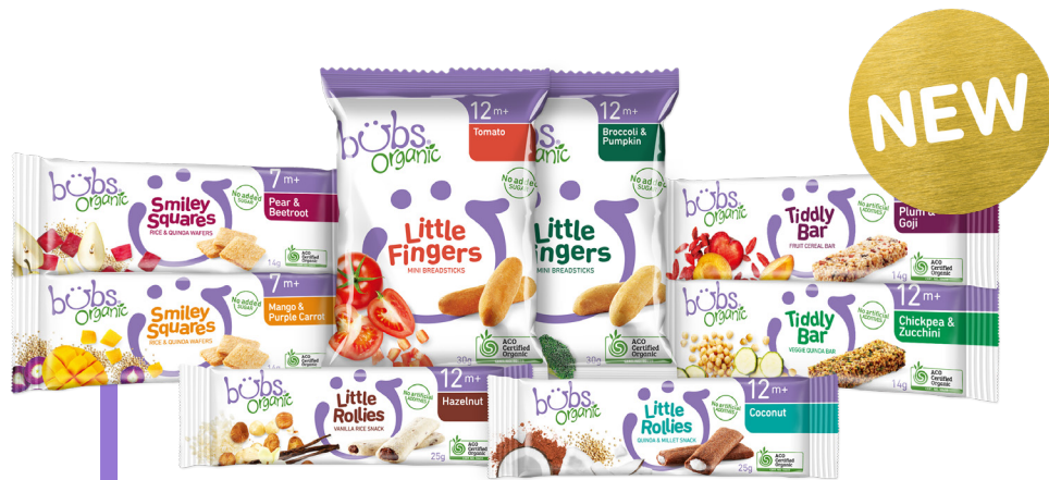
Organic Toddler Snacks Snack range to extend consumer lifecycle beyond first 1,000 days.

Grown Bubs® portfolio from 18 to 29 SKU's, now catering for all stages of development, feeding occasions and dietary requirements. With opportunity for further expansion in Adult Goat Milk Products.