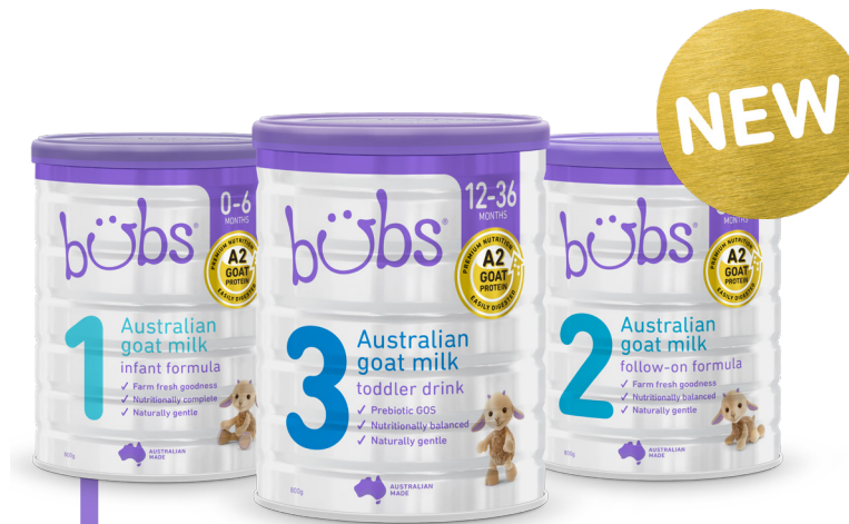
Infant Milk Formula Australian Goat Milk Improved formulation - worlds only infant formula sourced from Australian Goat Milk.