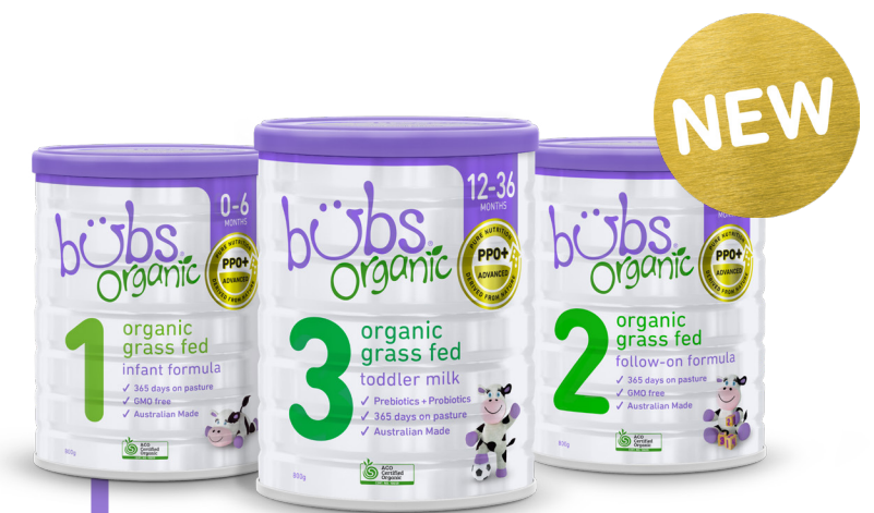
Infant Milk Formula Organic Grass Fed Australia's first Organic Grass Fed Formula with Prebiotics and Probiotics.