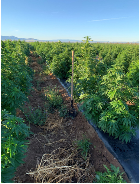
Left Image: An image of part of the Shephard Joint Venture field. Note the many laterals on this plant with many in the early stage of flower and cola development.

Right Image: An image of part of field Sirius. This image is a good example of the use of mulch plastic in keep weeds off the plant reduce root competition.