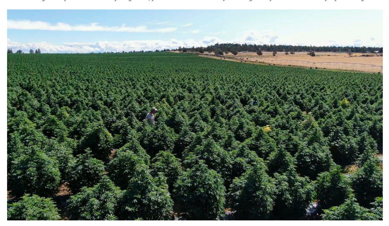
A drone image of a LogicalCropping employee evaluating crop growth on field Draco.