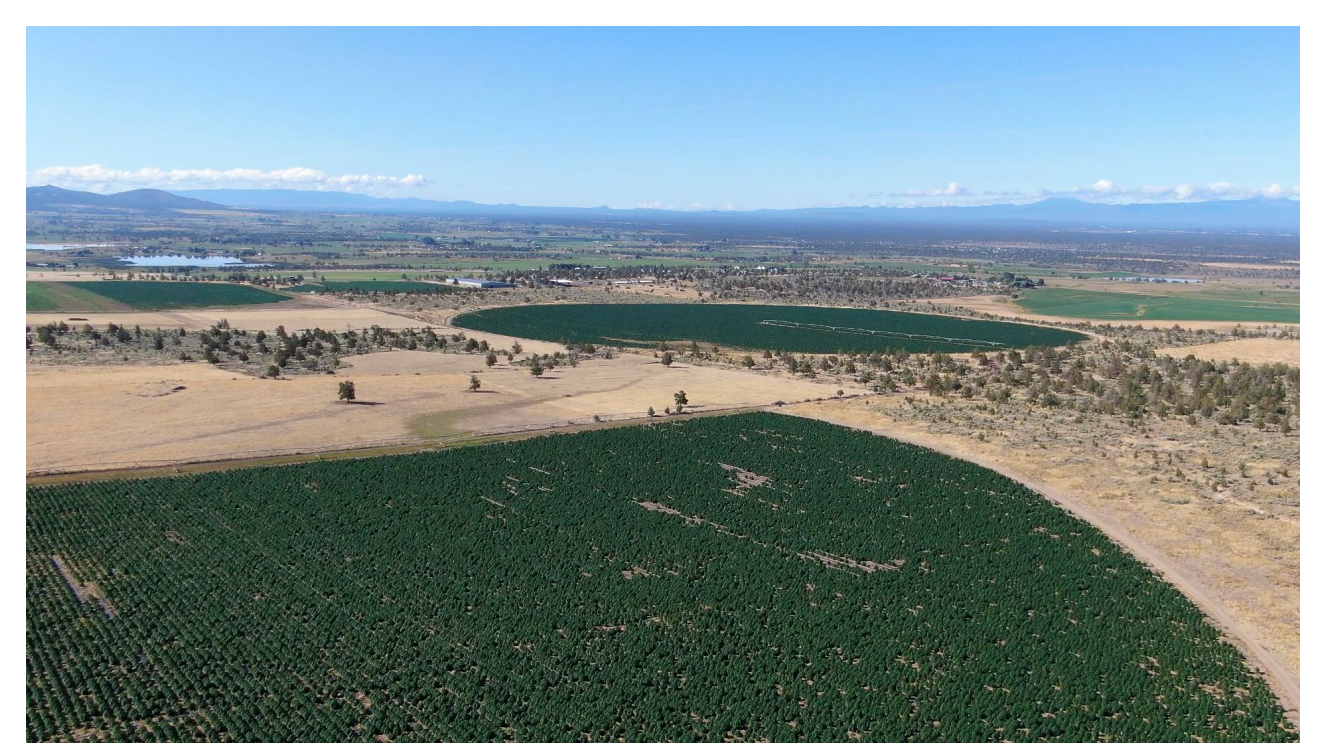
A\ drone\ image\ with\ field\ Draco\ in\ the\ fore\ ground,\ field\ Aries\ in\ the\ centre\ of\ the\ image\ and\ field\ Orion\ to\ the\ left\ of\ the\ image.