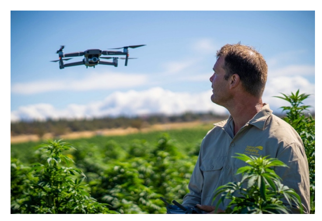
Figure 4: A LogicalCropping team member operating a drone to check the crop in Field Aries.

Agtech is used to optimise the success of the trial farm agronomy and farm management strategies.