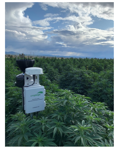
Figure 3: A CropLogic realTime IFMS unit in field Draco.

The majority of the acres of Hemp Trial Farm have been planted using 'starts' seedlings. which has been a successful method of cropping hemp. However, planting 'starts' comes at a cost and is a more involved method of planting. As such this may present limitations at scale.