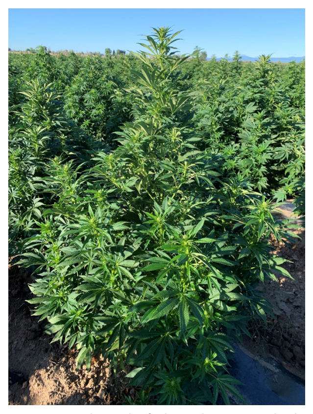
Figure 2: A good example of a hemp plant grown under the 'Christmas Tree' approach. Note the many laterals (branches) and then the buds (flowers) on each of the laterals. CBD producing oils are predominantly found in hemp flowers. Image taken from field Hercules.

Each lateral has the potential to produce flowers and it is in this flower that predominantly the CBD containing oils are found. As such the close spacing methodology for fibre production is less suitable for CBD production and CropLogic has adopted what has become known as the 'Christmas Tree' approach, allowing the plants room to spread out and produce many flower producing laterals.