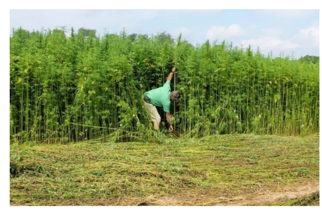
Figure 1: An example of a field where the hemp for fibre methodology of close spacing is used. Note the long, slender plants, limited laterals (branches) and limited flowers.

Industrial hemp has historically been developed for fibre. The fibre is predominantly located in the stalk of the hemp plant and plants are grown in close plant spacings and touching their neighbour. Plants grown in this manner typically have longer stalks, are slender and have limited branches (laterals) with genetics and then plant spacing being strong contributing factors to this. Close spacing methodology has thus been popular with hemp for fibre growers.