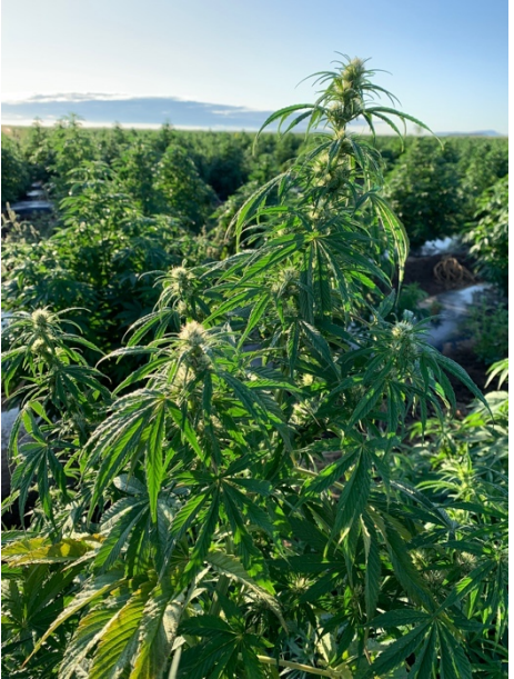
Left Image: An image of plant on field Draco showing good flowering in the early stages on both the apical (main) and lateral colas.

Right Image: A close up photo of another good example of a plant grown under the 'Christmas Tree' approach.. Note the primary apical (centre) cola (flowering part of hemp plant), and then lateral colas. This image is from field Sirius