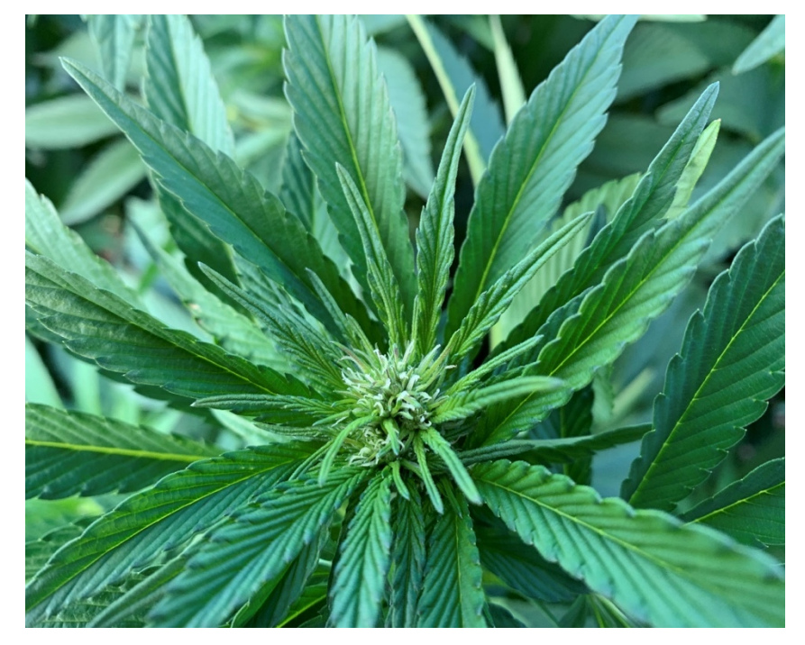
A close up image of a bud (flower) in early stages of development. A noticeable turpine aroma has been noticed on CropLogic's fields, particularly on field Sirius. Turpines are essential to the develop of CBD producing oils.