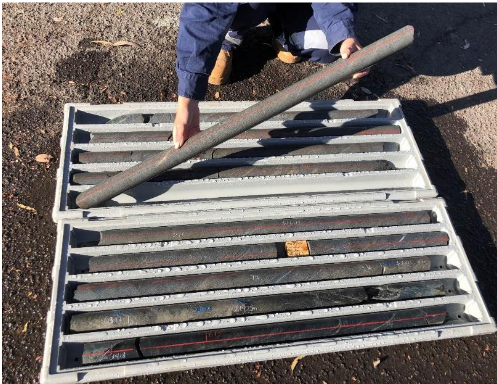
Figure 1: MDD323W2 core photo showing massive and heavy matrix nickel sulphides

The intersection is part of the previously announced drilling program being completed over a six-week period before moving to the CS1 channel and the untested magnetic anomaly (see Figure 2).