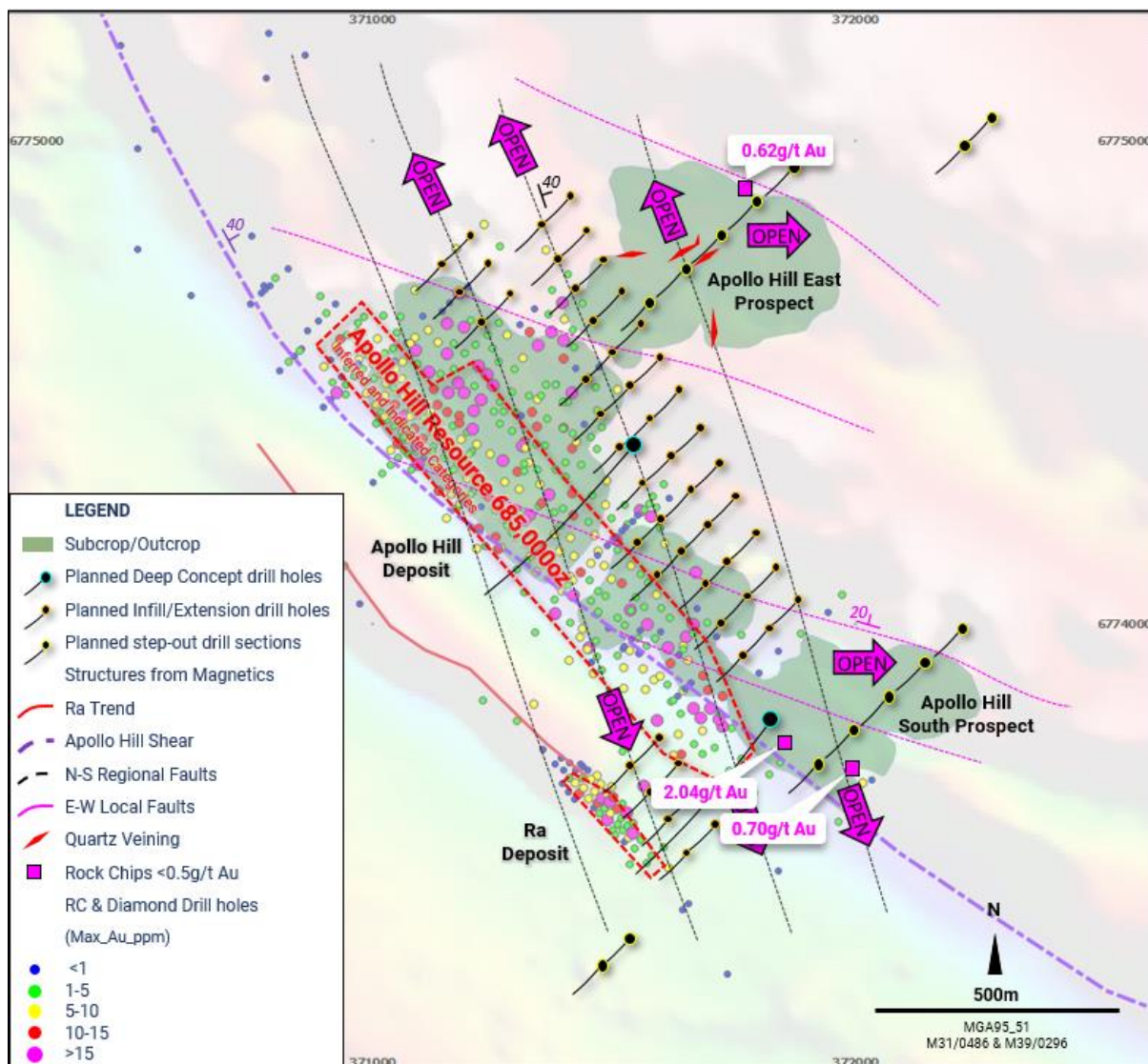
Figure 1 - Planned exploration and resource extension drilling locations relative to the published resource and recent hanging wall drilling. Drilling seeks to develop mineralisation primarily in the shallow hanging wall splays where recent higher grades have been returned. Recently collected magnetic data and new geological mapping and rock chipping have provided a new targeting for expansionary drilling immediately east of and adjacent to the new hanging-wall lodes. b Drilling results depicted originally reported in fuller context in Saturn Metals Limited ASX Announcements, Quarterly Reports and Prospectus - as published on the Company's website. Saturn Metals Limited confirms that it is not aware of any new information or data that materially affects the information on results noted.

1 Details of the Mineral Resource which currently stands at 20.7 million tonnes grading 1.0 g/t gold for 685,000 ounces and a breakdown by category are presented in Table 1 (page 5 of this document) along with the associated Competent Persons statement and details of the original ASX report that this information was originally published in.