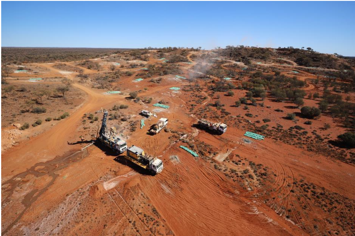
Figure 2 RC drilling underway at Apollo Hill hanging walls.

A handwritten signature in black ink, appearing to read 'I. Bamborough'.