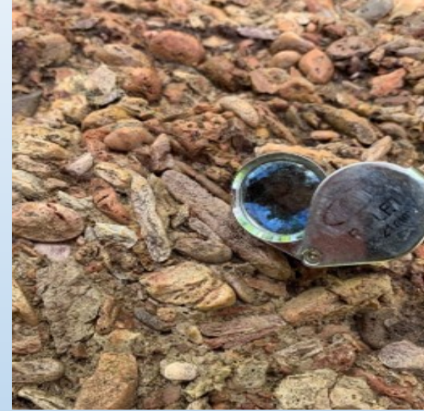
Figure 2: Bouba Plateau Conglomerate Bauxite

Conglomerate bauxite is also visually very distinctive and unique when compared to typical insitu bauxite