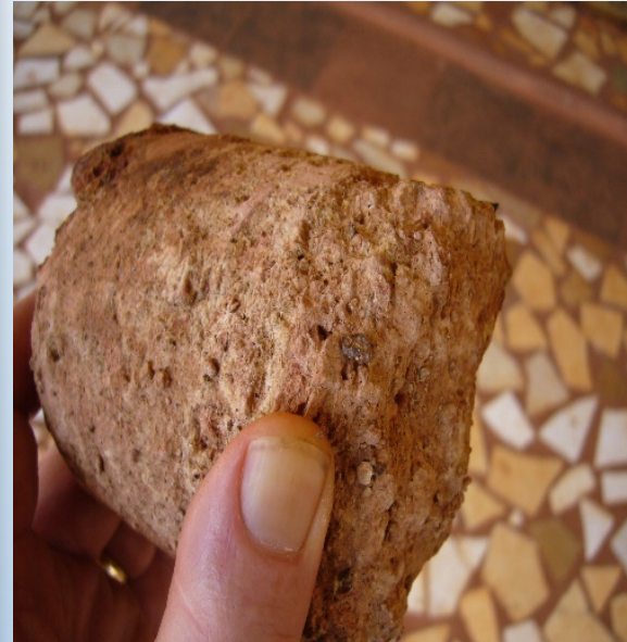
Figure 1: Typical Insitu Bauxite