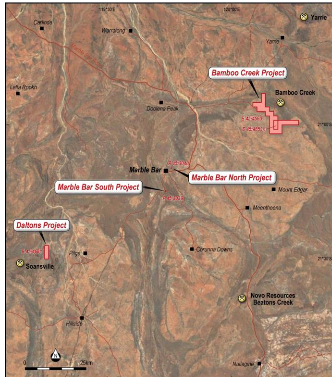
Figure 2: Map showing the location of MinRex's four East Pilbara project areas

The work completed in the current program focussed on following up on the earlier very encouraging rock sampling results at the two Bamboo Creek project exploration licences (Figure 2) with detailed rock sampling and geological mapping to better understand the gold and base metals prospects now identified and continue the search for as yet undiscovered mineralised systems. In all 180 samples were collected from the larger lease (E45/4560) and 50 samples from the smaller lease (E45/4853) for a grand total of 230 samples.