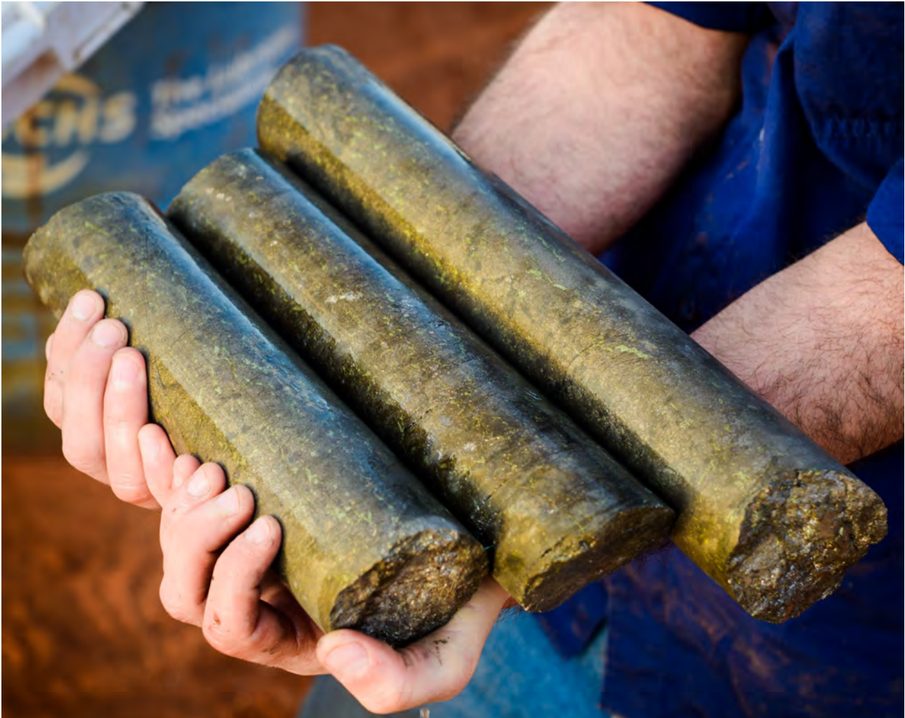
Figure 1 – drill core from MAD152 with massive sulphides that returned assays of 2.55m @ 4.29% Ni, 1.46% Cu and 3g/t PGEs from 49.05m

“The strong rally in the nickel price over recent months is likely to be very favourable for the project economics of a potential development at Mt Alexander, and we are pleased to initiate preliminary studies to assess a potential mining development at Mt Alexander.”