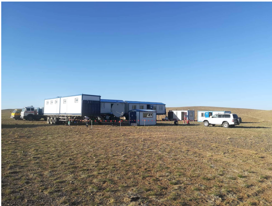
Camp set up at well site