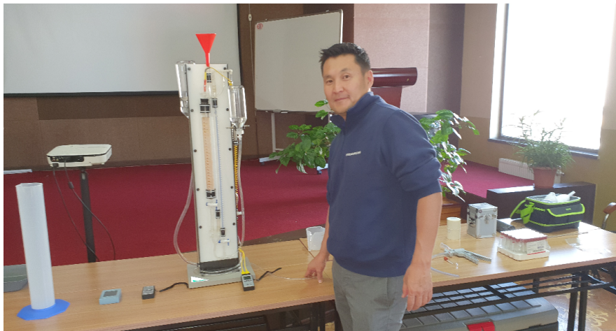
Training seminar on desorption equipment in Ulaanbaatar

International standard desorption and permeability testing tools have arrived from the USA and Australia respectively and initial training over the use thereof with the local contractors has been undertaken.