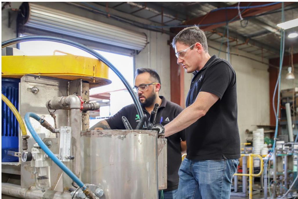
Image 1 – Testing of Maniry Concentrate at ALS Perth. Test work by potential offtake partners will confirm the high-quality graphite results from ALS.

The provision of the Maniry Concentrate samples to targeted organisations is an important step in the qualification process and through in-house testing by potential offtake partners, will provide confirmation that the concentrate is suitable for the industry specific applications. Upon successful testing, the Company expects to enter into a Memorandum of Understanding with suitable offtake partners, before proceeding to binding offtake arrangements.