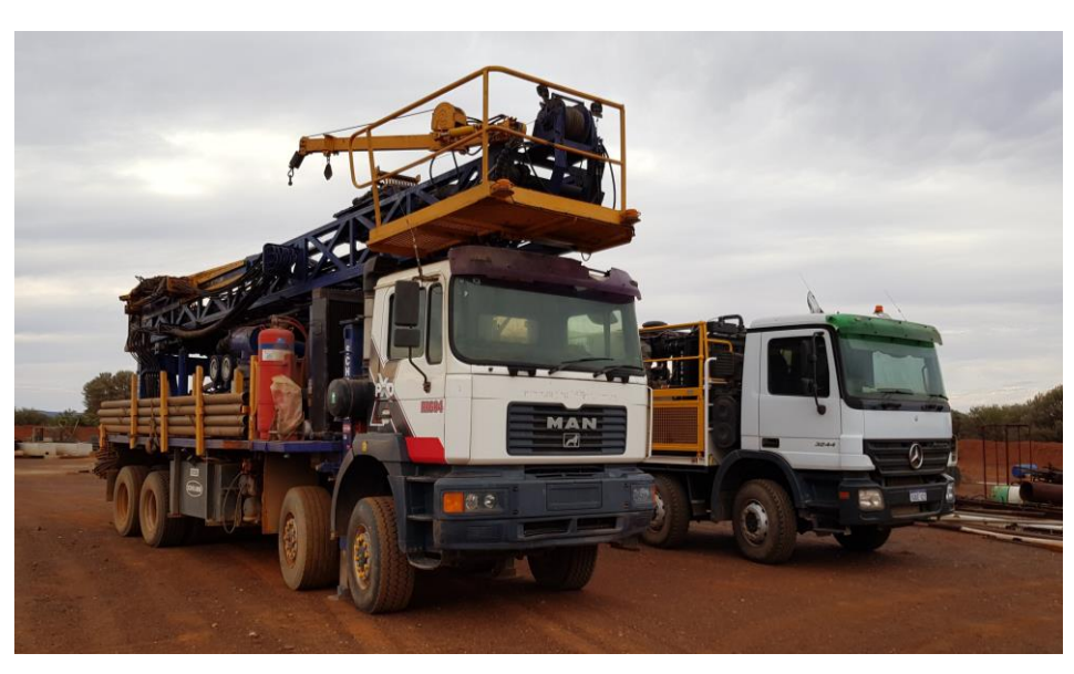
Figure 1 - Drill rig arriving on site