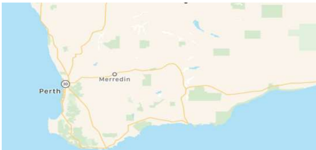
Figure 1. Location of Merredin, close to the Noomberry Halloysite Project