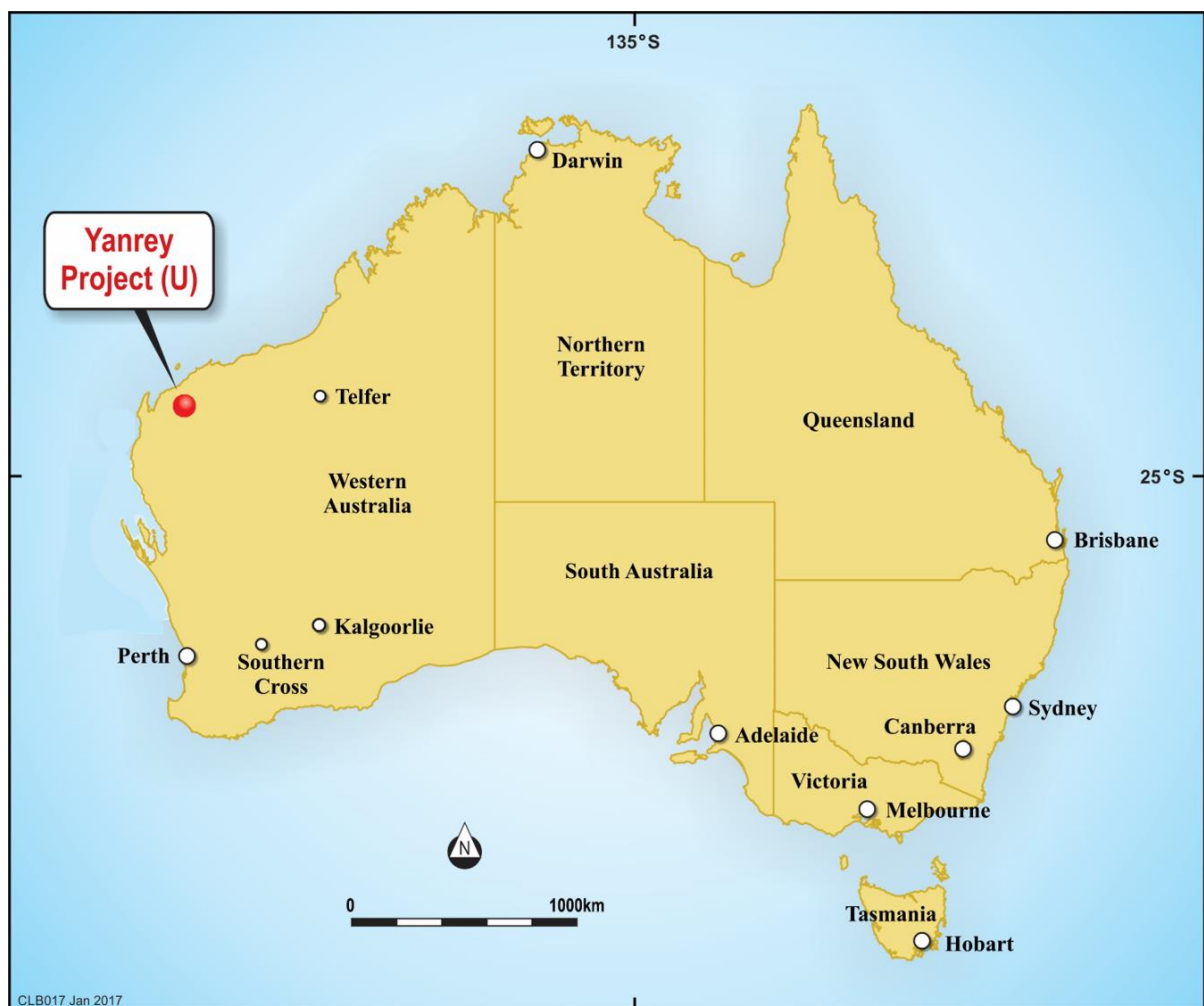
Figure 1: Major Project Locations in Australia

Further field work at Bennet Well is on hold until clarity on Western Australian uranium exploration policy is received from the Minister of Mines and Petroleum.