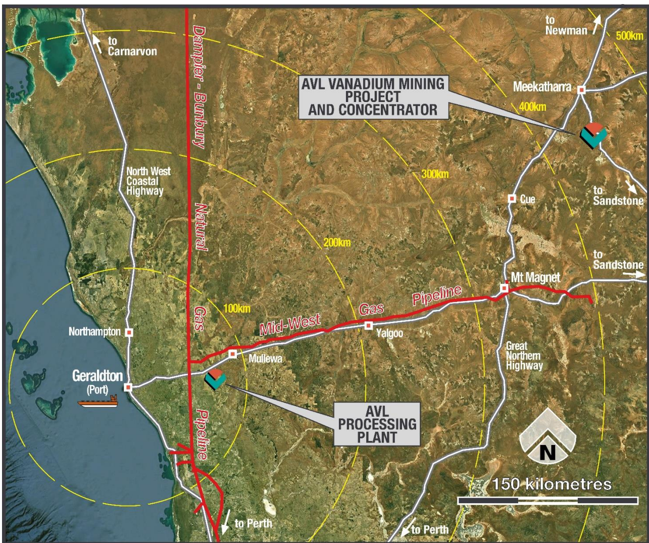
Figure 1 Proposed Location of Processing Plant

AVL has commenced a detailed engineering study for the processing plant relocation, which will define the associated costs related to the move. Trade-offs between operating expenses, logistics and transport costs, plant capex and associated infrastructure costs will inform AVL's final decision to relocate.